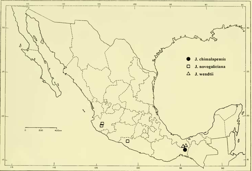
FIGURE 2. Map of Mexico showing the distributions of Justicia chimalapensis , J. novogaliciana , and J. wendtii .